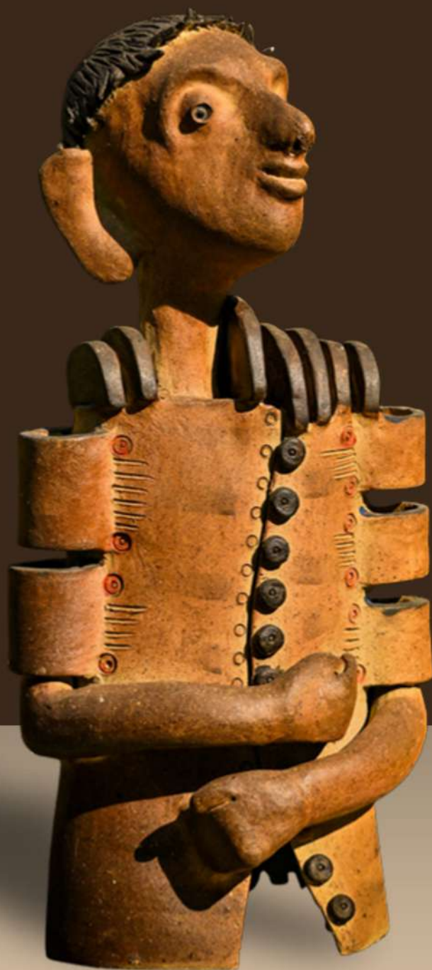
Ceramic 21" x 10" x 8.5"