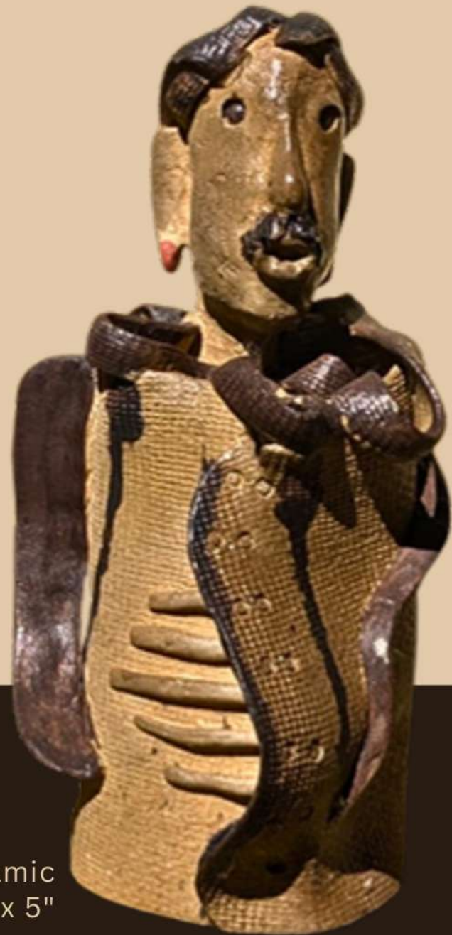
Ceramic 10" x 6" x 5"