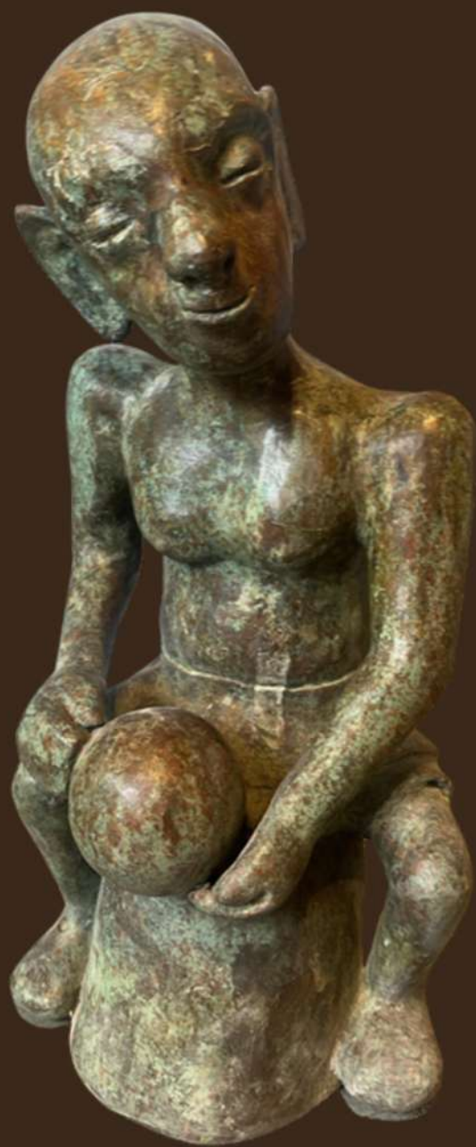
Bronze 9.5" x 9.5" x 20"