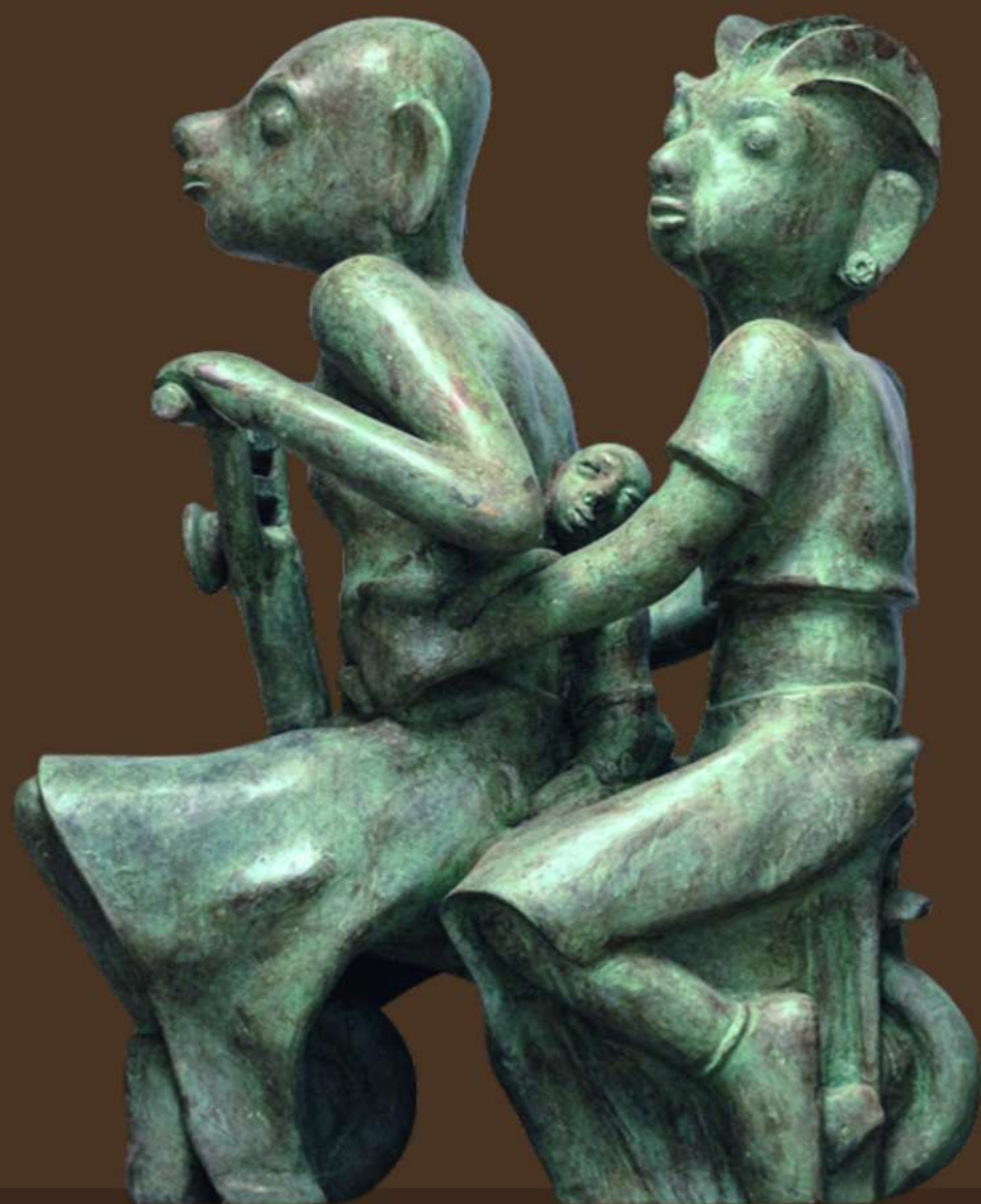
Bronze 30" x 24" x 17"