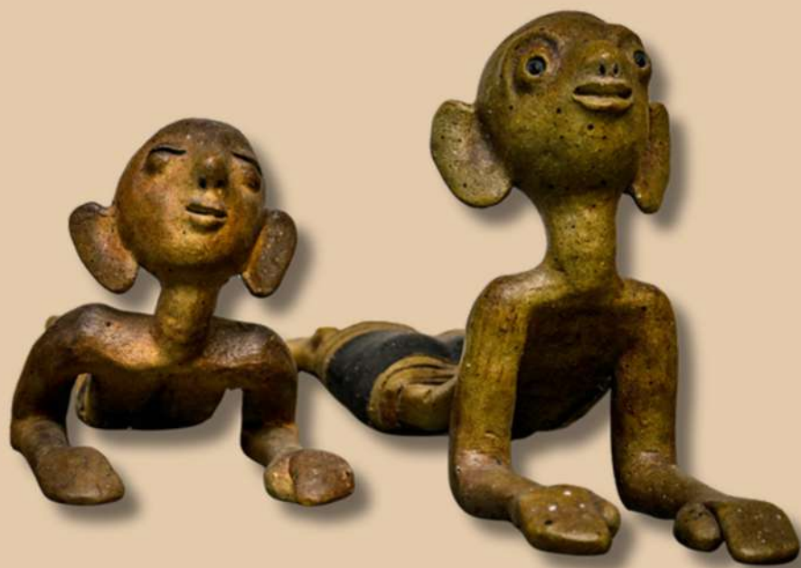
Ceramic 18.5" x 6.5" x 6.5" (R) 13.5" x 8" x 5" (L)