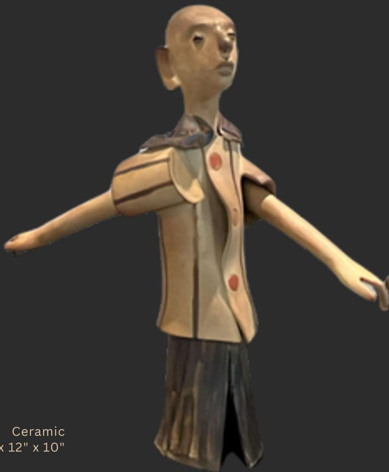
Ceramic 33" x 12" x 10"