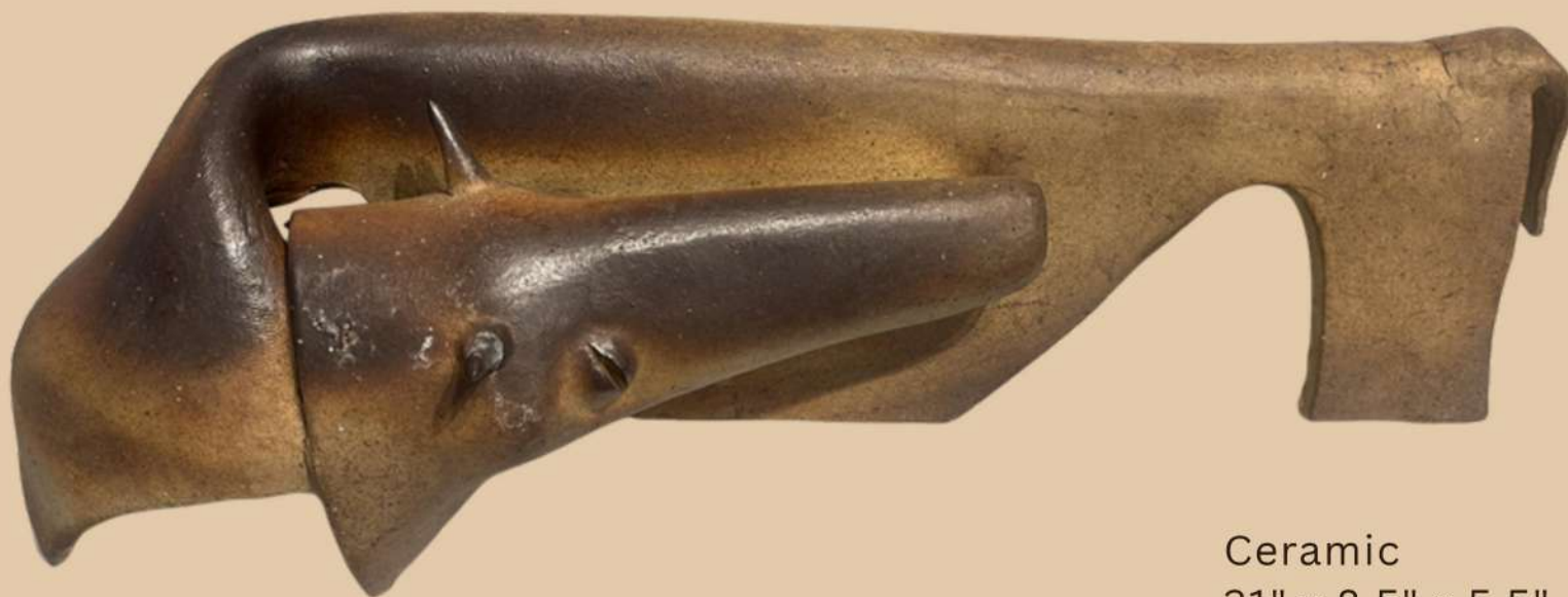
Ceramic 21" x 8.5" x 5.5"