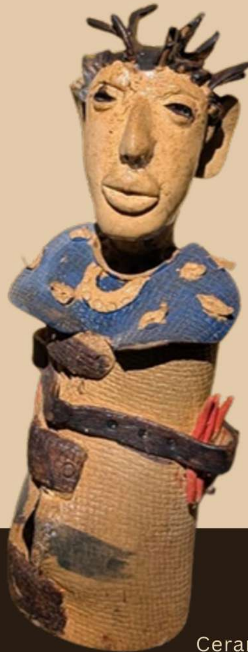
Ceramic 14" x 7" x 5"