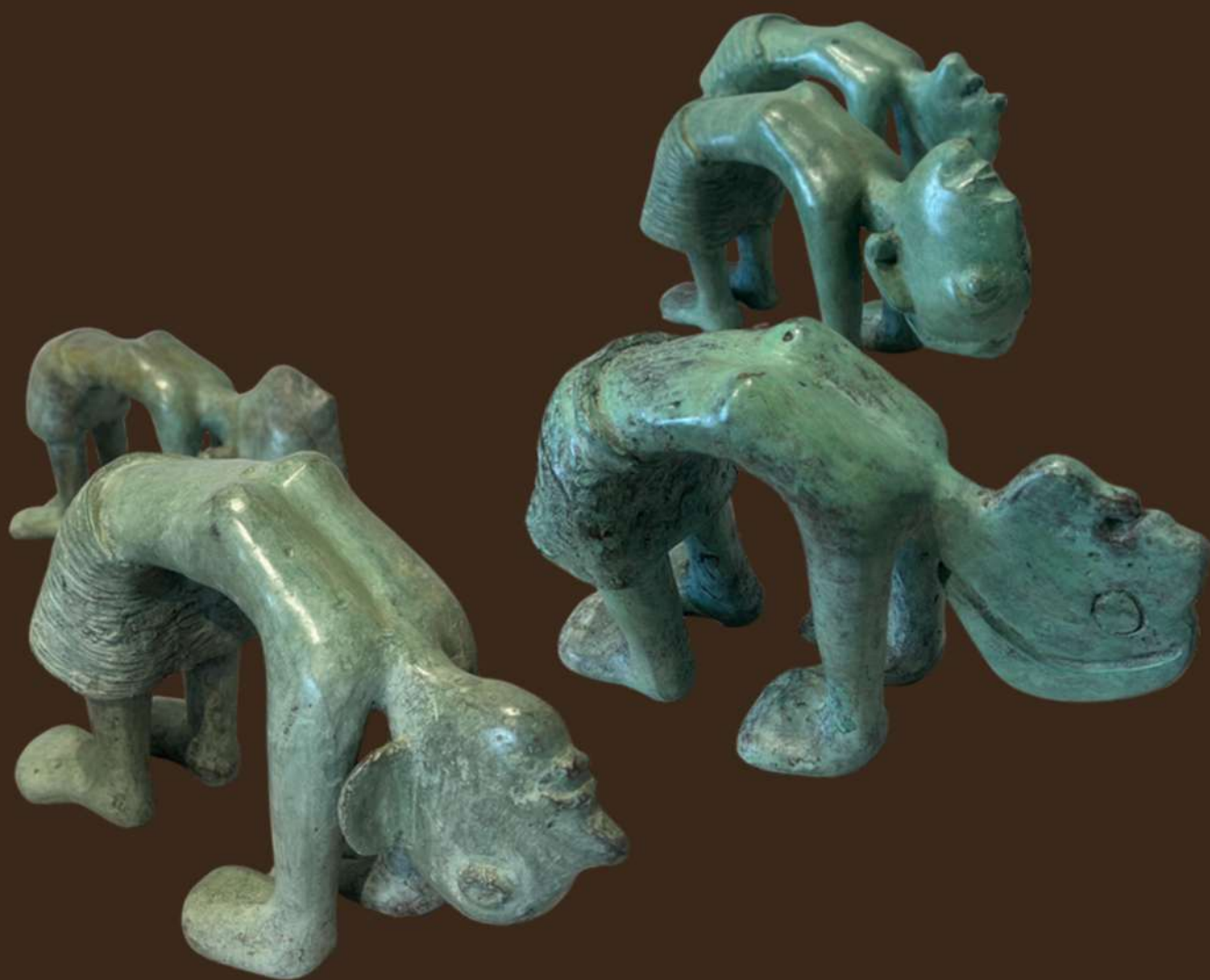
Bronze 10" x 4.5" x 5.5"(each approx)