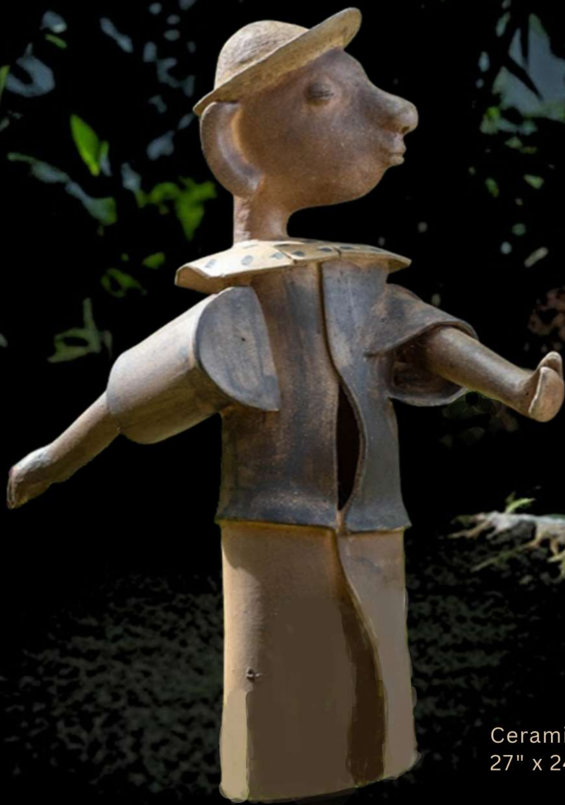
Ceramic 27" x 24" x 12"