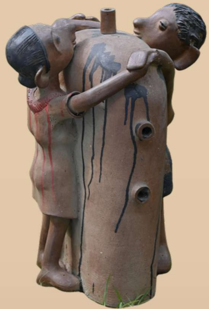
Ceramic 25" x 19" x 18"