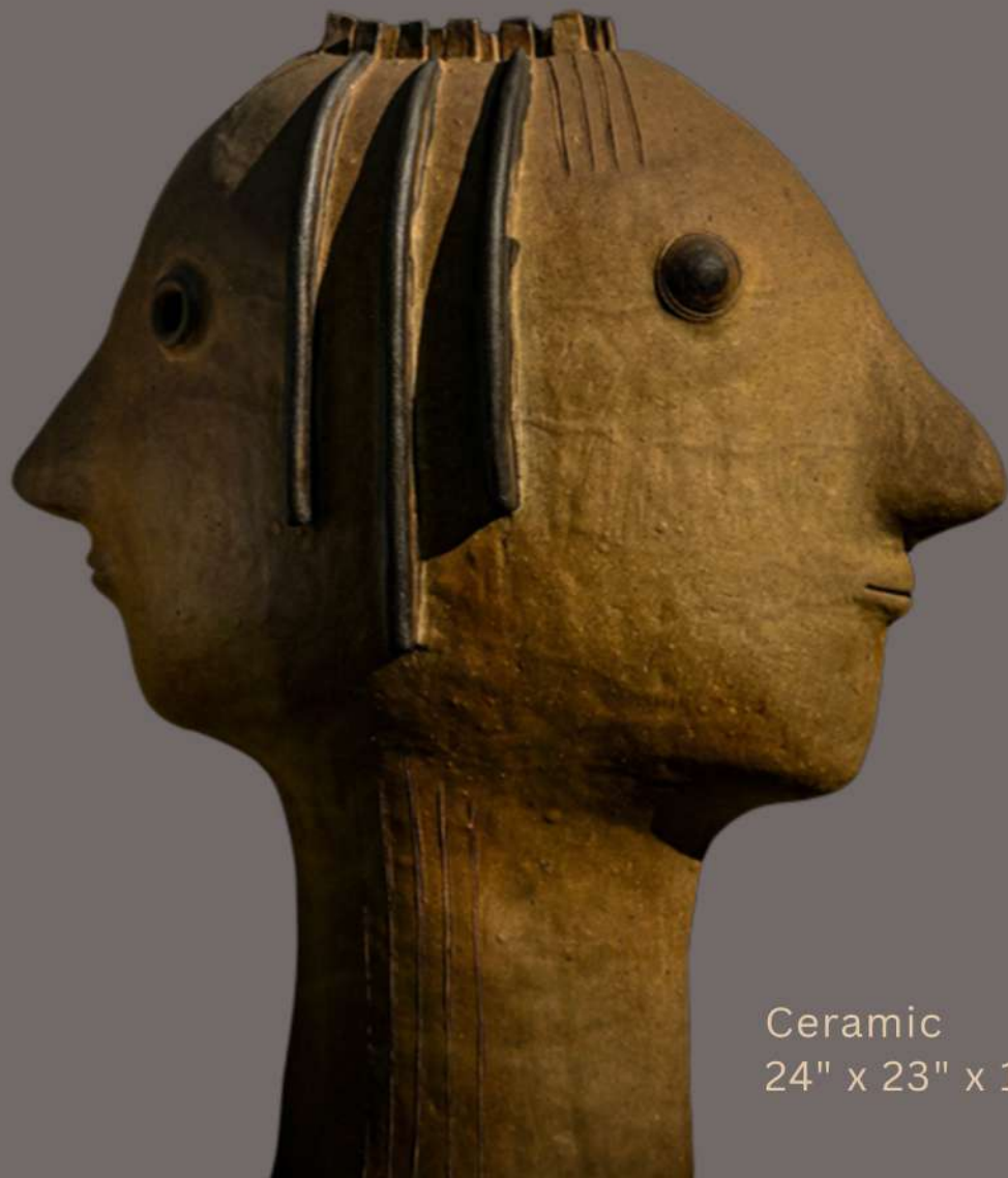
Ceramic 24" x 23" x 12"

- Bose Krishnamachari Painter and Curator