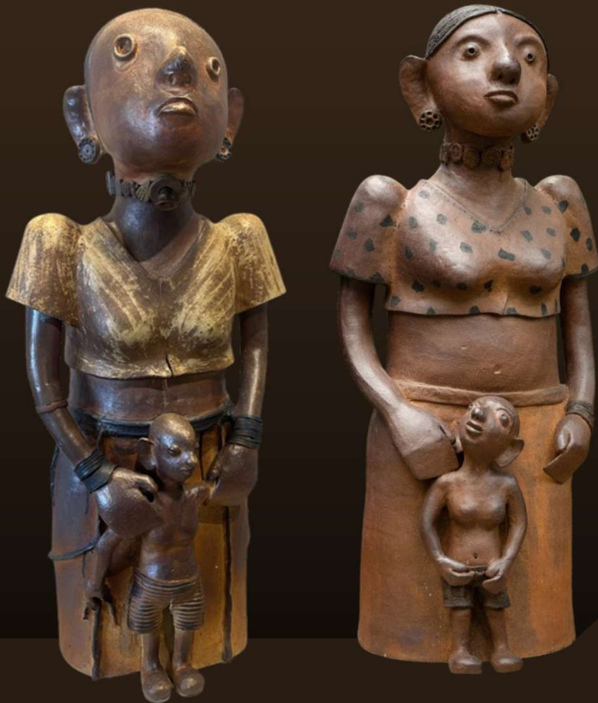
Ceramic 43" x 20" x 15" (R) 42" x 20" x 16" (L)