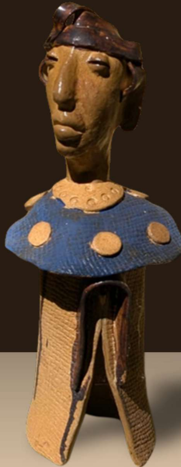
Ceramic 14" x 7" x 6"