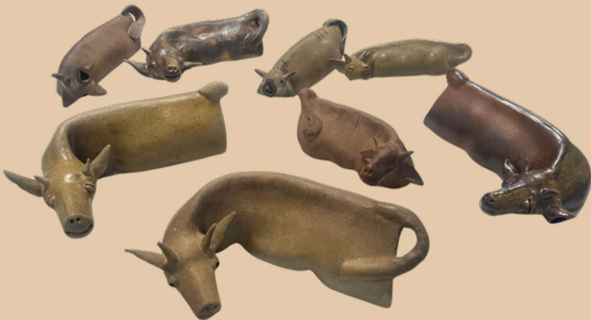
Ceramic From 11" to 20"