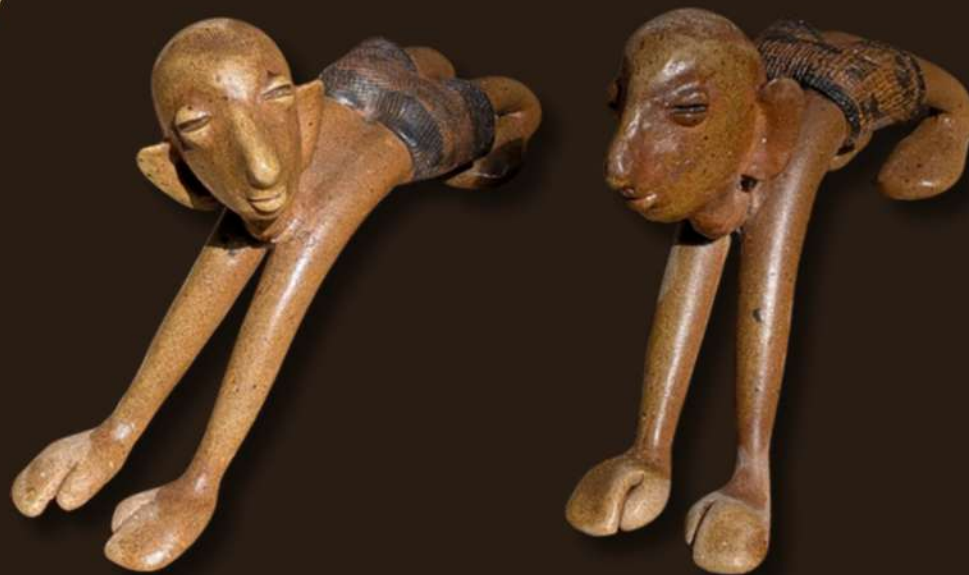
Ceramic 13" x 8.5" x 4.5" each