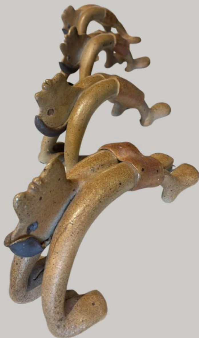
Ceramic 8.5"x 4"x5" each