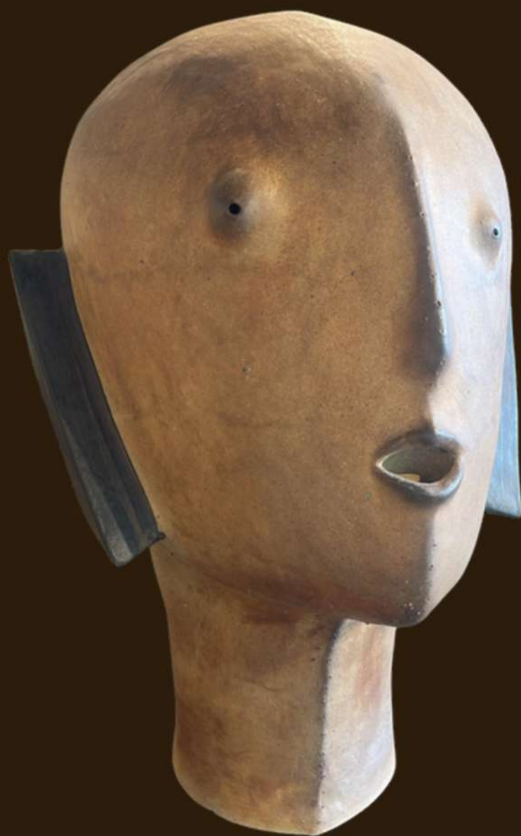
Ceramic 22" x 15" x 22"