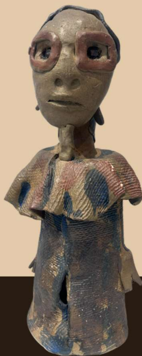
Ceramic) 16.5" x 6.5" x 5.5"(L) 4"x5.5"x10.5"(R