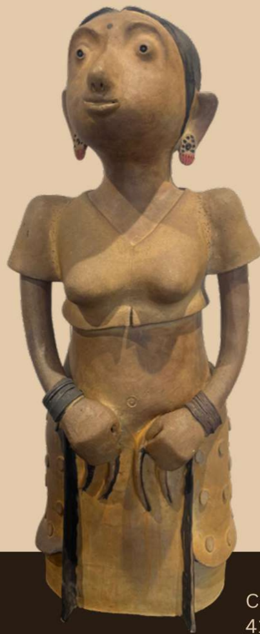
Ceramic 41" x 19" x 14" (R) 39" x 17.5" x 15" (L)