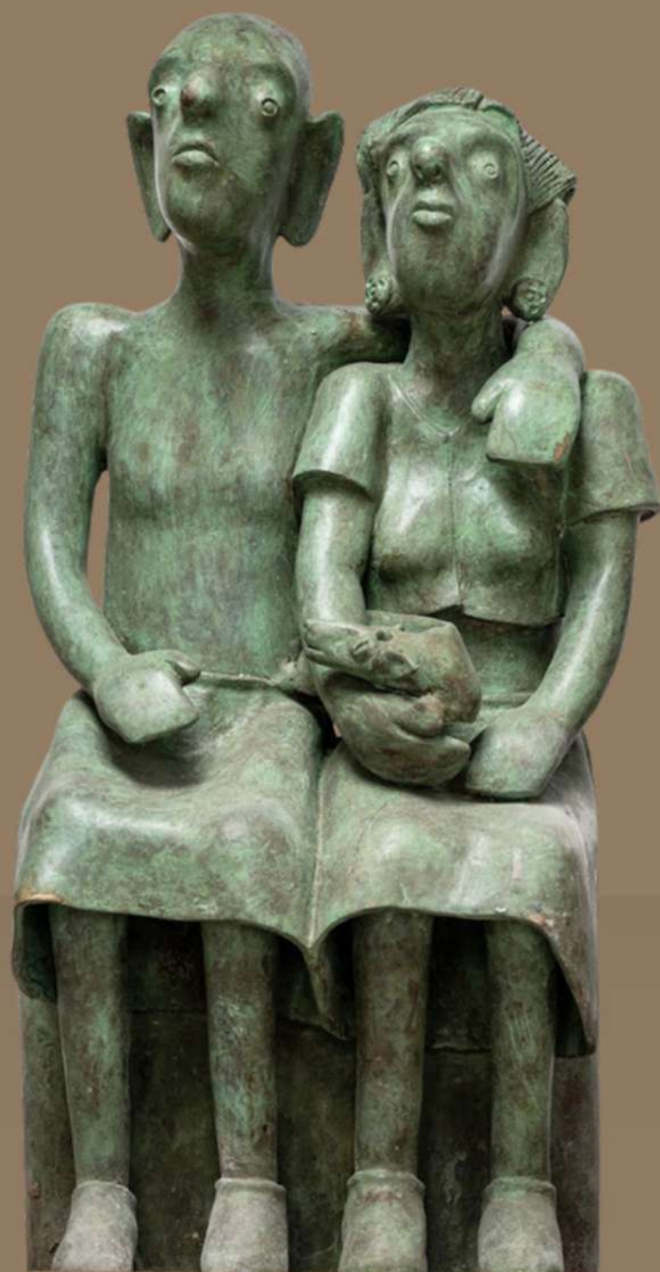
Bronze 33" x 17" x 13"