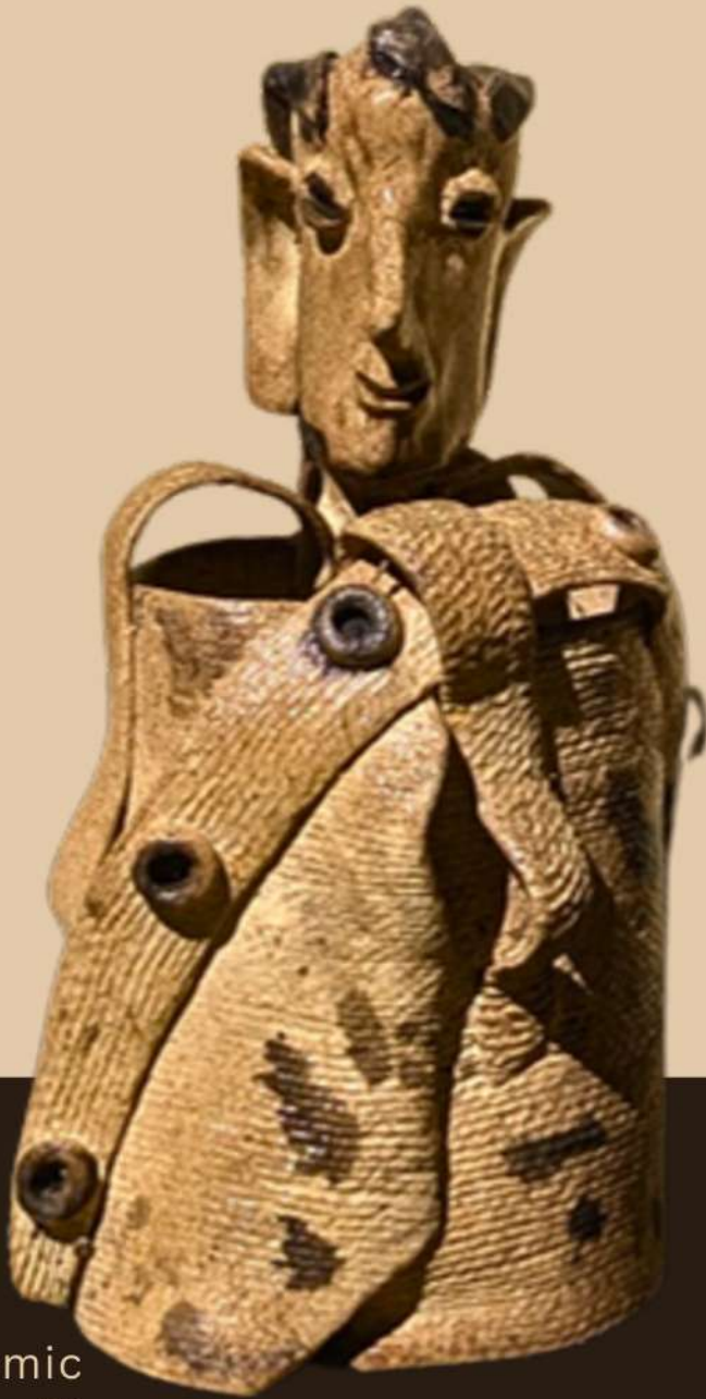
Ceramic 10" x 6" x 5"