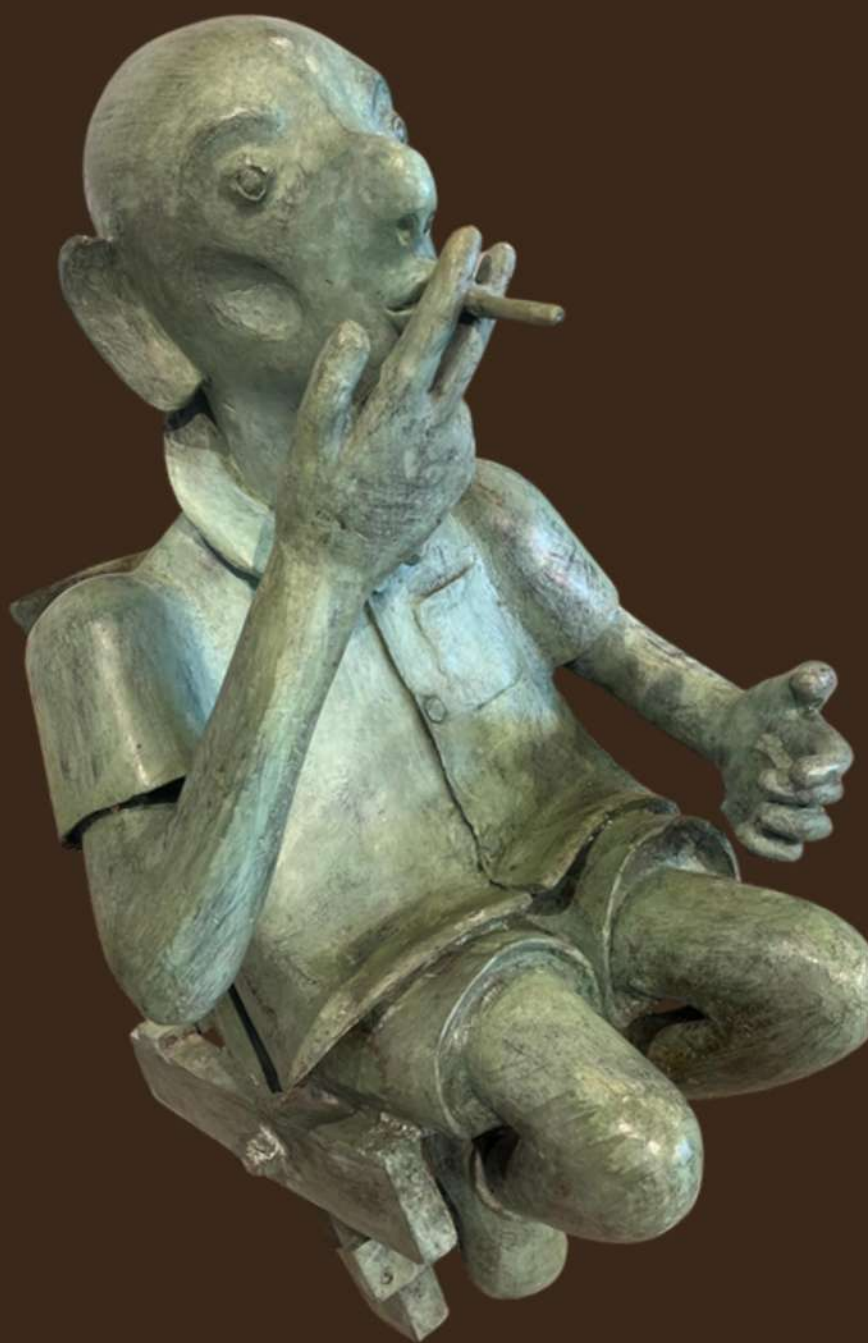
Bronze 17" x 15.5" x 26"