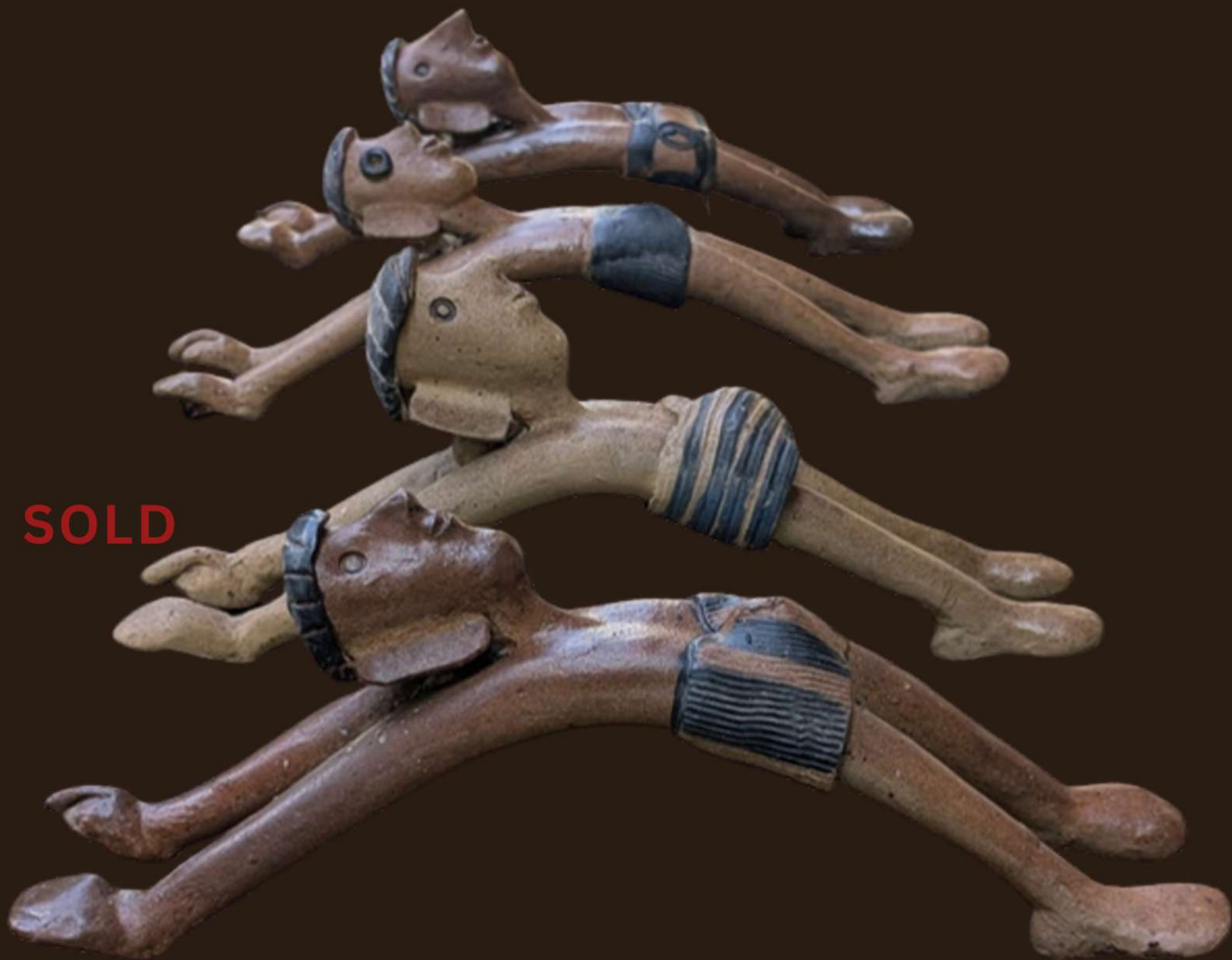
Ceramic 7" x 14" x 5"