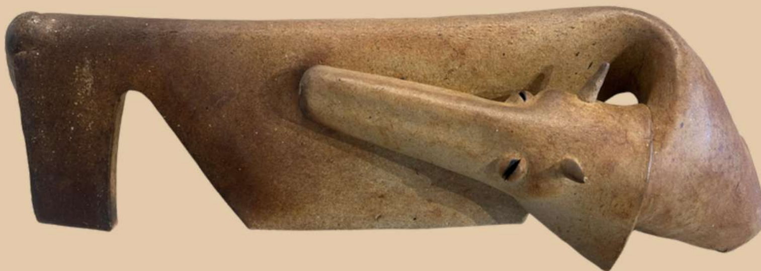
Ceramic 23" x 8" x 5.5"