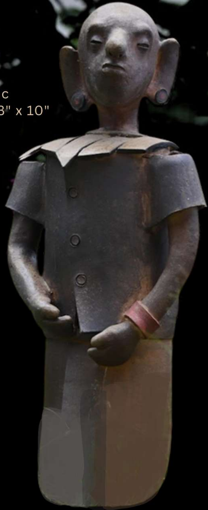
Ceramic 27" x 13" x 10"