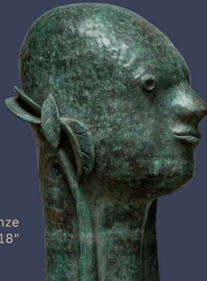
Bronze 28" x 19" x 18"