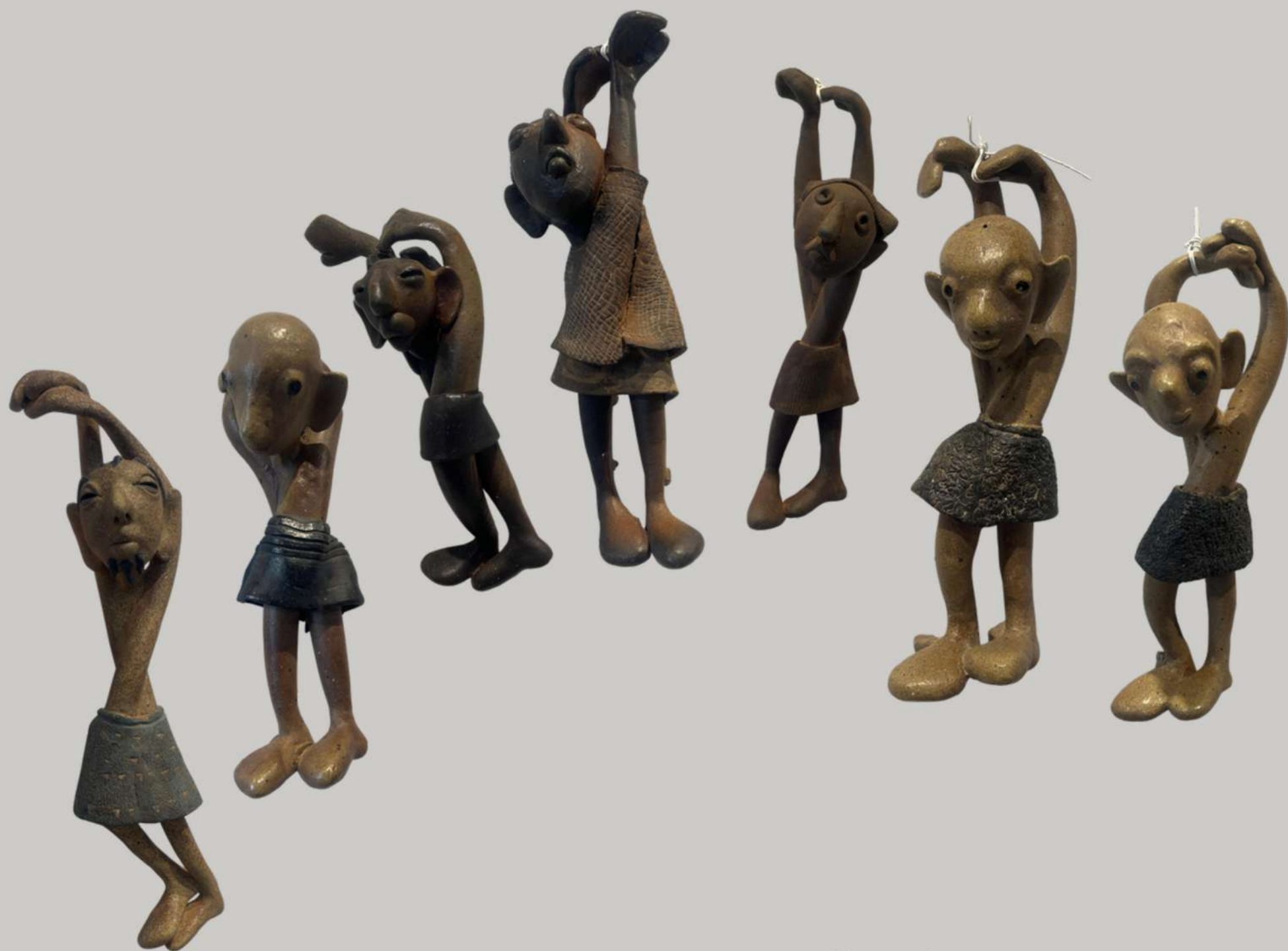
Ceramic From 21.5" x 5" x 4.5" to 10"x5"x3.5"