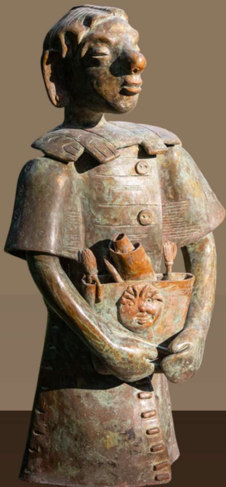
Bronze 28" x 15" x 9"