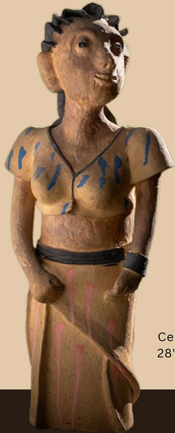
Ceramic 28" x 13" x 9"