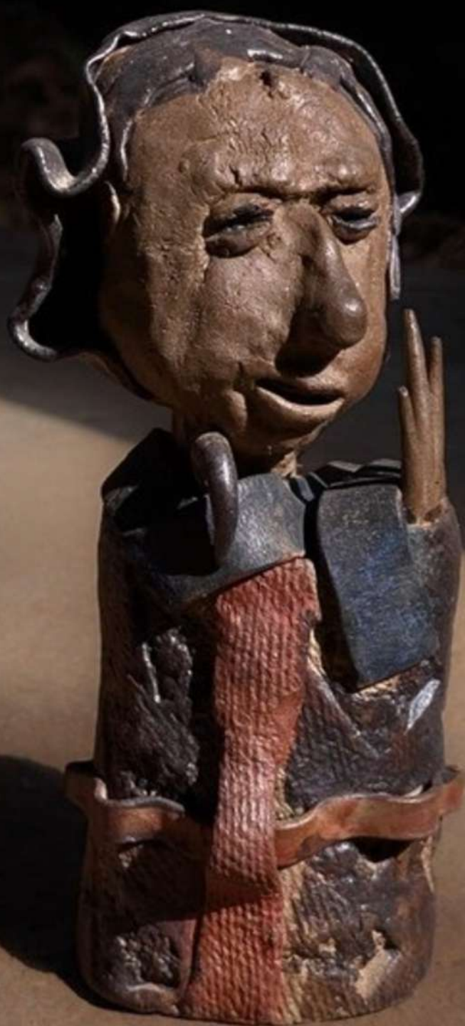
Ceramic 10" x 5" x 4"