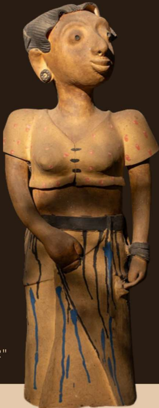
Ceramic 34" x 15" x 12"