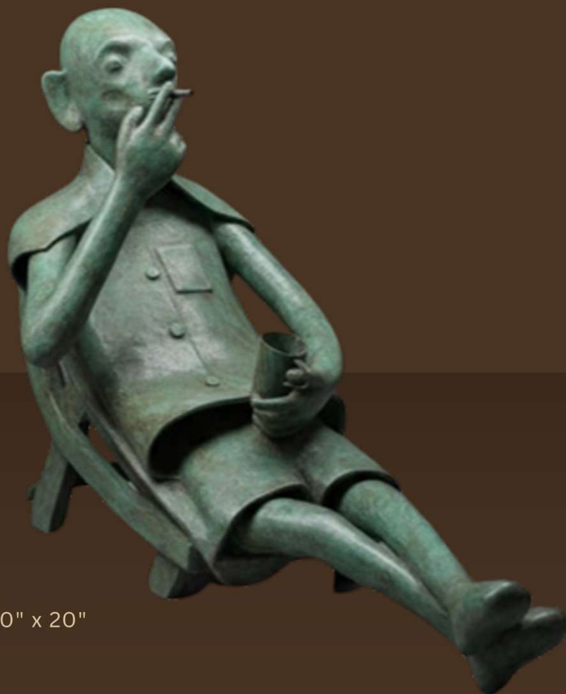
Bronze 30" x 40" x 20"