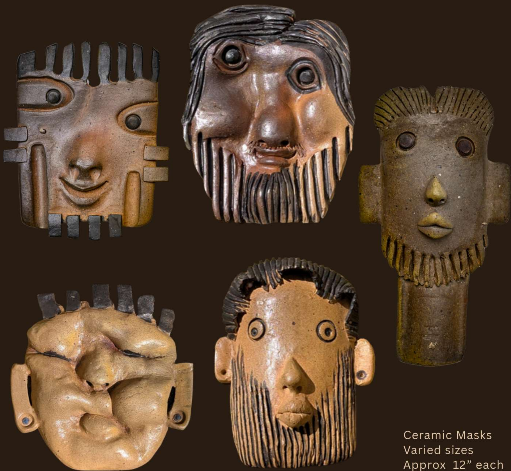
Ceramic Masks Varied sizes Approx 12" each