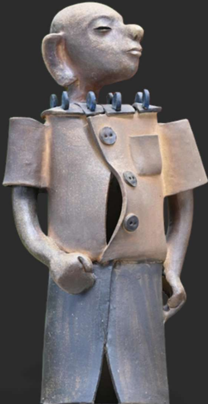
Ceramic 27" x 14" x 8"