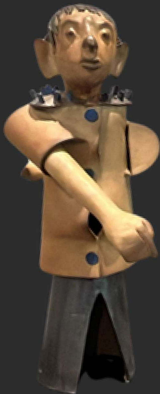
Ceramic 30" x 12" x 26"