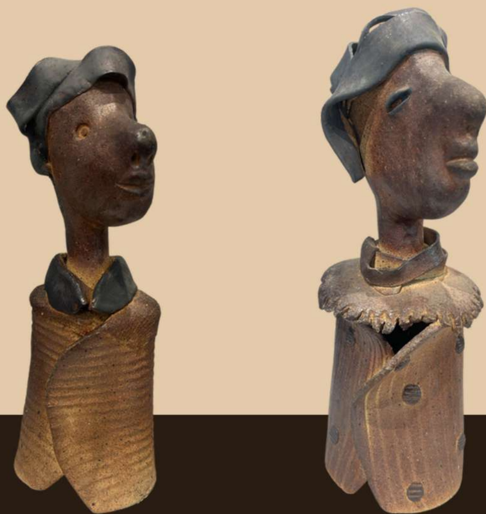
Ceramic) 3.5" x 4.5" x 10"(L) 3.5"x4.5"x10.5"(R)