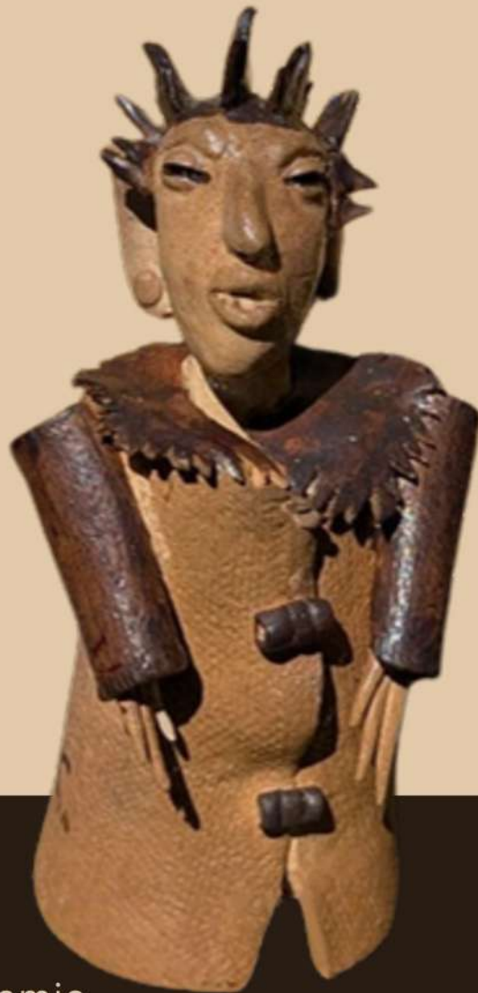
Ceramic 12" x 6" x 5"