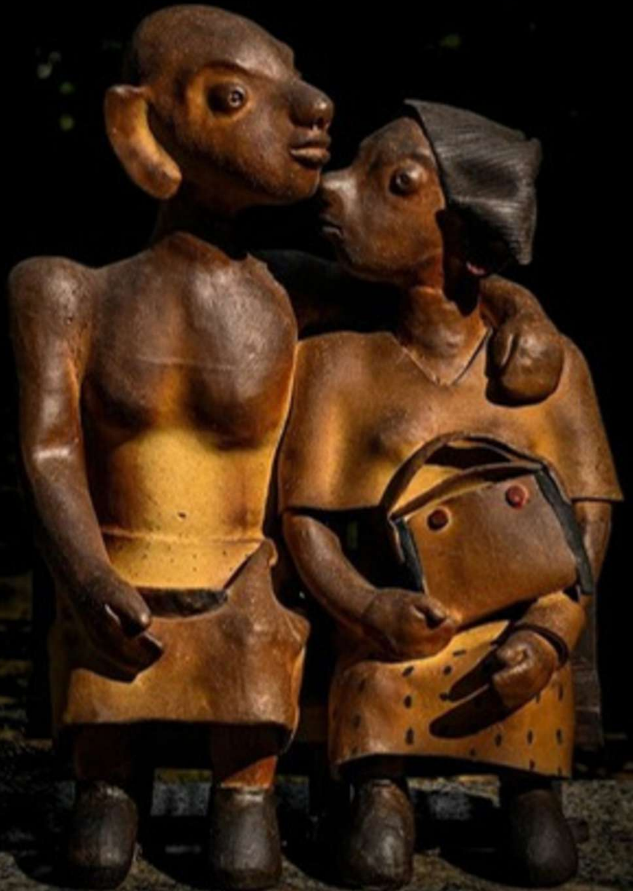
Ceramic 19" x 25" x 13"